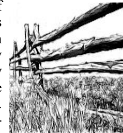
Which side of the "fence" are you on?

Sign-up for the weekly, e-mail version of The Bible View at: www.OpenThouMineEyes.com