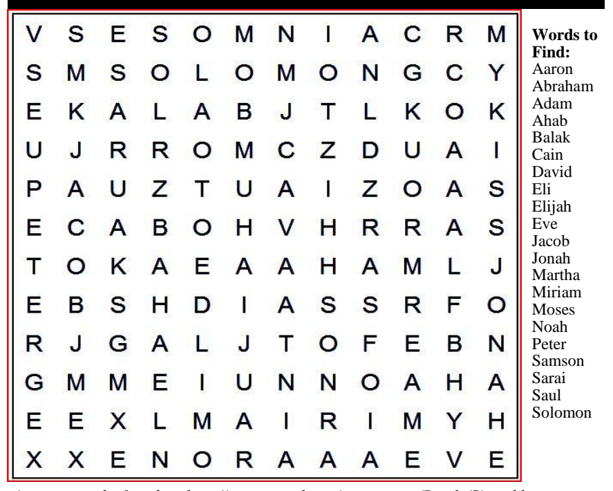
Answers can be found at: http://www.openthoumineeyes.com/Puzzle/Sinned.htm