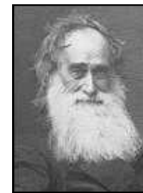
Missionary Robert Moffat, 1795-1883

"Yes," he replied, "it has been a dull year, sadly dull to me. Yet, I mind me that one did come, wee Bobby Moffat. But he is so wee a bairn, that I suppose it is not right to count him."